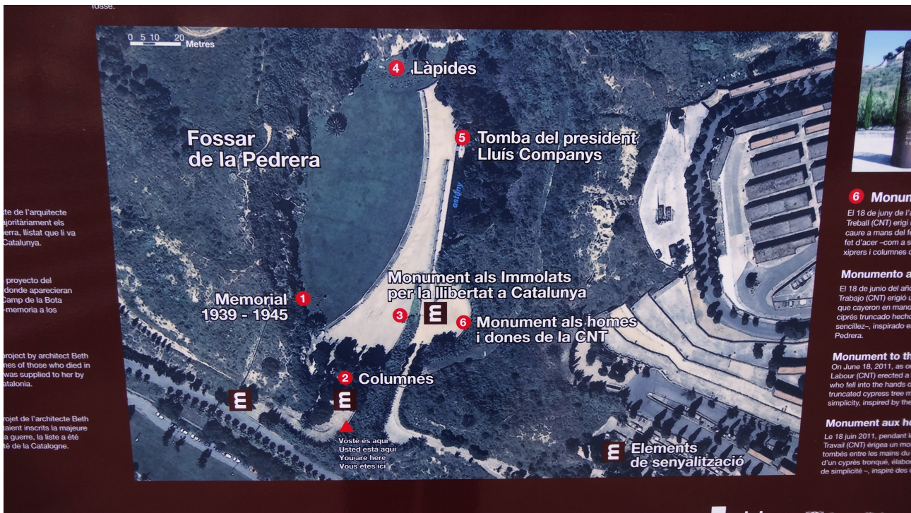
Mass Grave 'Fossar de la Pedrera' in Barcelona